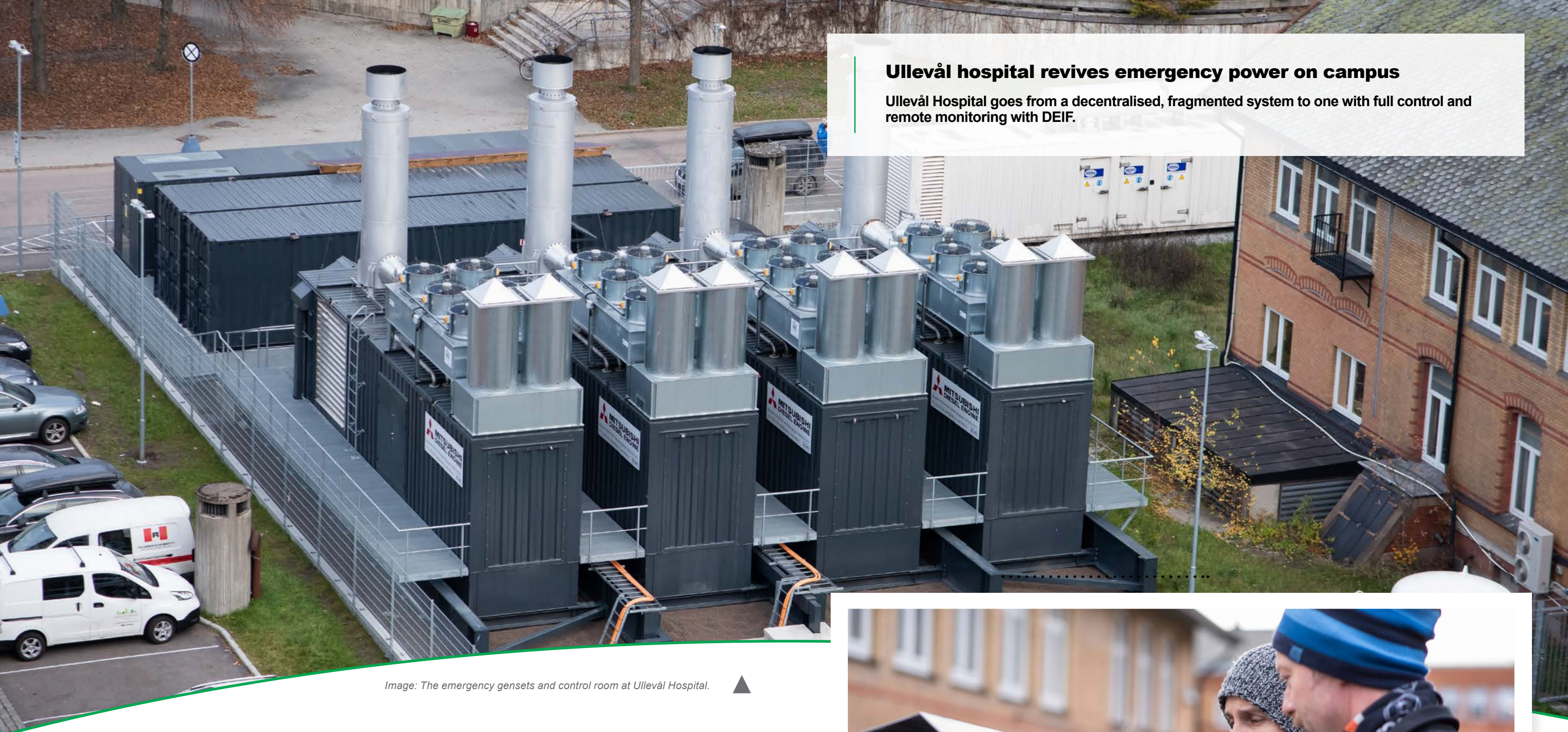
Image: The emergency gensets and control room at Ullevål Hospital. ▲

Ullevål Hospital goes from a decentralised, fragmented system to one with full control and remote monitoring with DEIF.